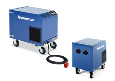
FE 24/7 2.5

400V, 3-phase version with additional capacity for one or two torch applications (two inlets).